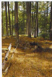
The vast majority of shoreline is crown land, making shore lunches a tempting option.

The system’s scenery offers a nice mix of cottage-dotted shores and tree-clad areas void of development. “A vast majority of the area here is crown land,” said Welton. “There are only a few cottages on our lake, but you see more on some of the other lakes.”